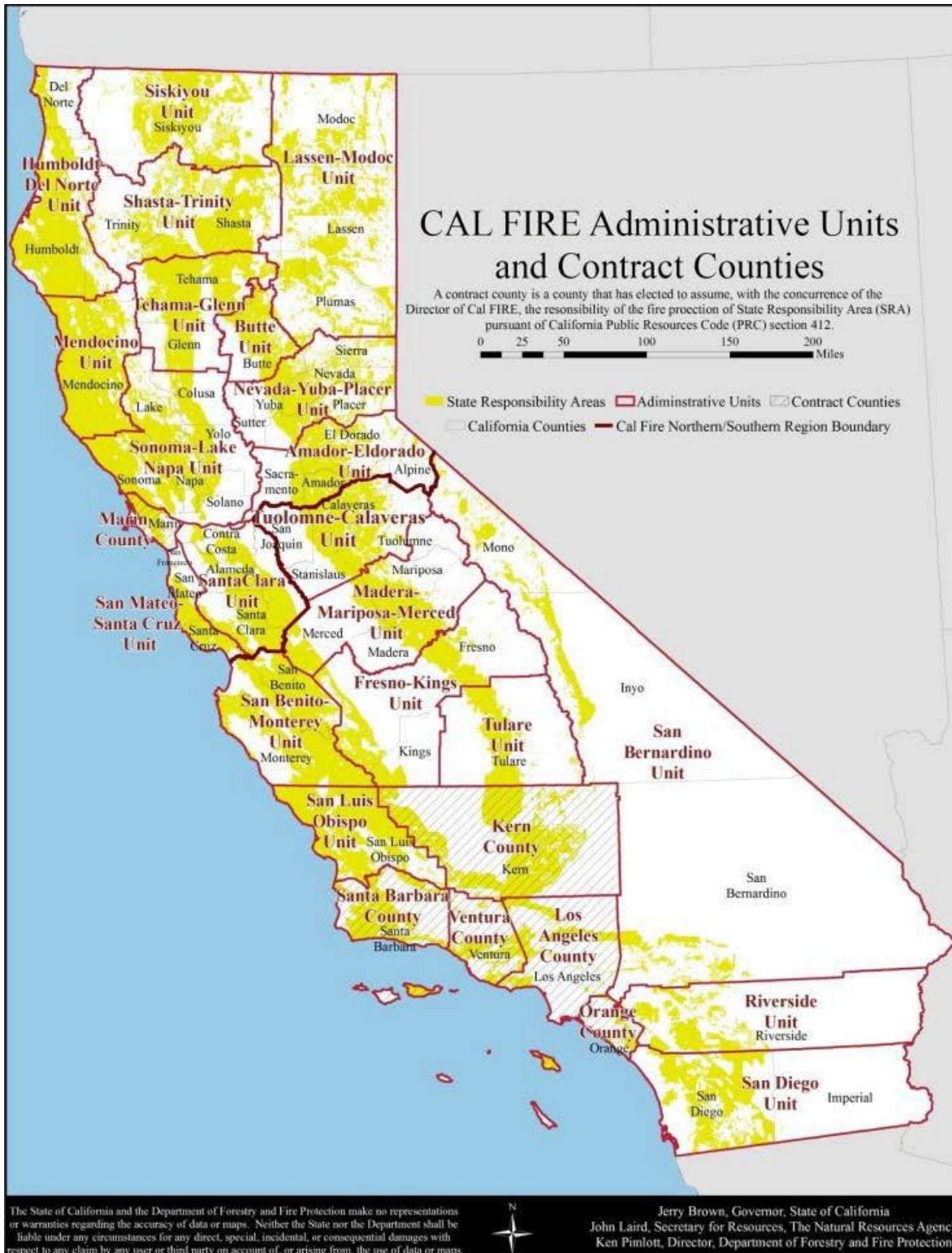
CHART 2.0: CAL FIRE ADMINISTRATIVE UNITS AND CONTRACT COUNTIES