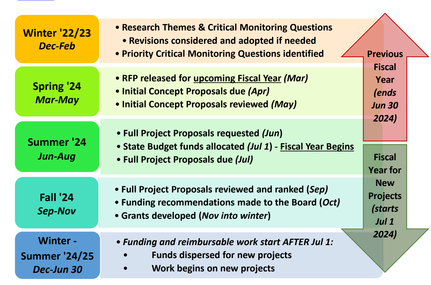
Figure 1. Sample Anticipated EMC Project Submission and Grant Processing Timeline Key: RFP = Request for Proposals.

EMC projects are solicited through an annual Request for Proposals (RFP) which is released following the start of the new FY (see Figure 1 ). The RFP, ranking, and selection process are detailed in the Strategic Plan (EMC 2022).