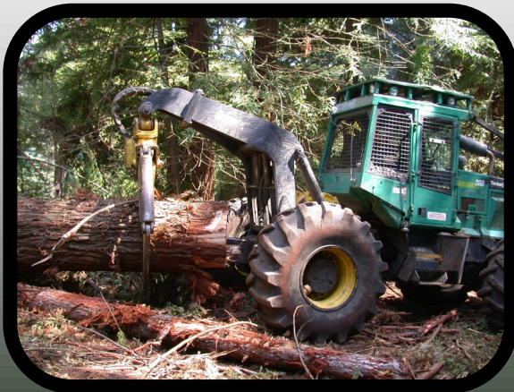
Timber Harvest Planning and Implementation

Many foresters opt for self-employment. They usually serve as consultants to both public and private forest owners. Their work might involve developing and evaluating forest management plans, or they may be hired to investigate and do special studies on the forest or forestry-related activities. Consulting foresters also do appraisals and marketing of timber for public and private interests and assist individual landowners in selling timber and other forest products.