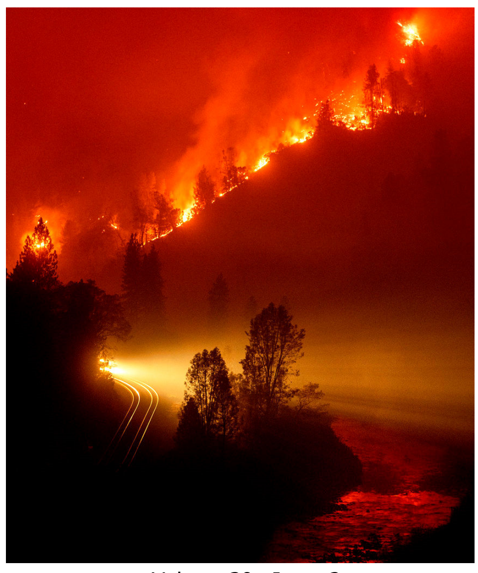
Volume 30 - Issue 2 Photo: The "Delta Fire" burns near the Sacramento River threatening transporation infastructure, forests and water quality.