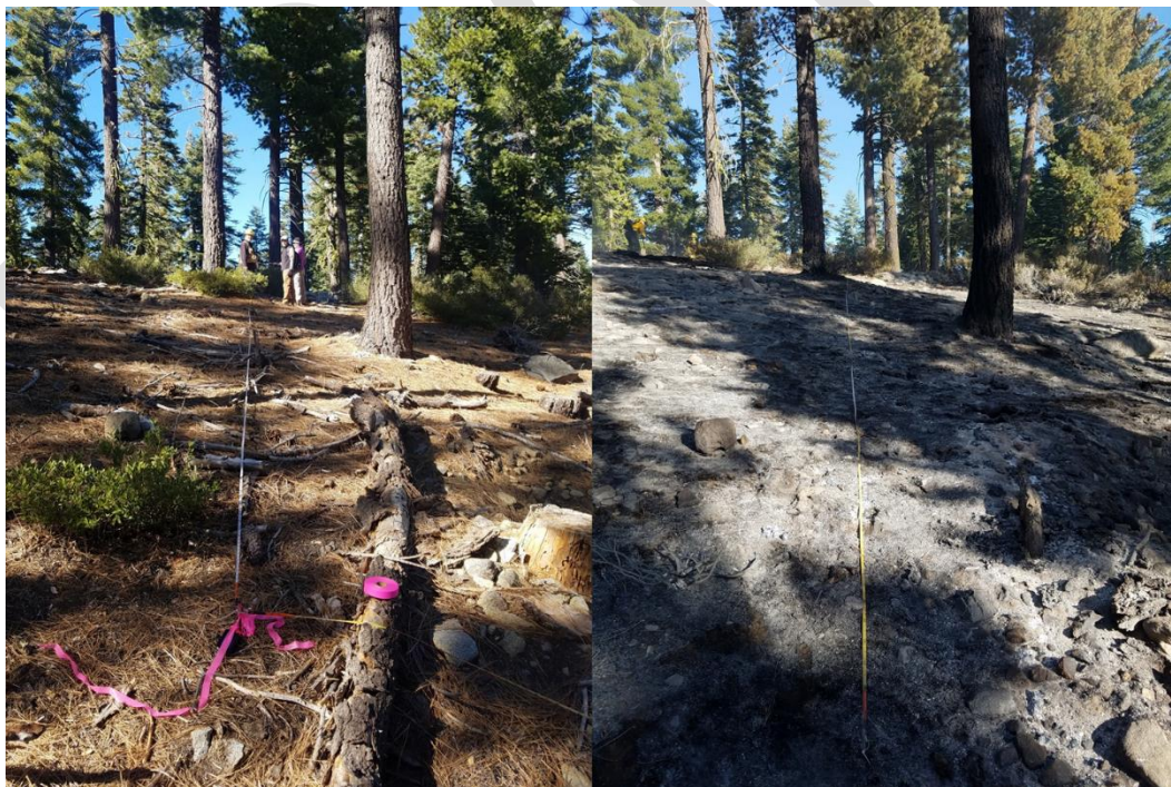
Pre- and post-fire measurements of fuels at Sugar Pine Point State Park, October 2018