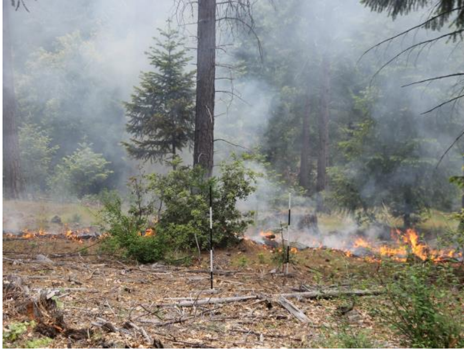
Rate of Spread measurements during prescribed fire, Doaks Ridge, July 2018.