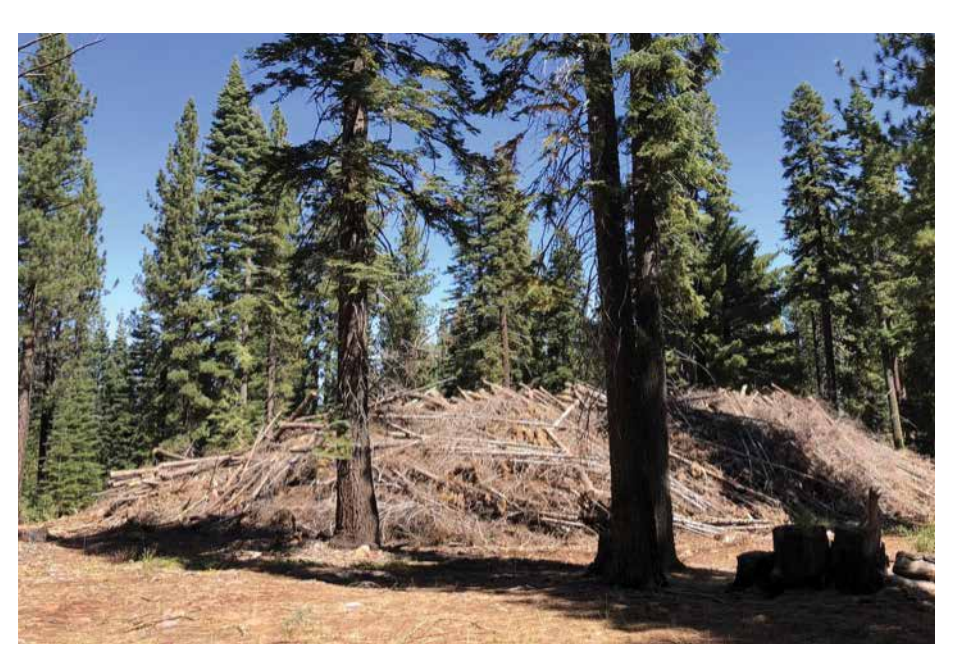
There are hundreds of thousands of tons of biomass sitting in landing piles in the Tahoe-Truckee forests, very few will ever make it out of the forest.