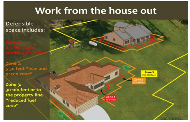
Figure 3. Both UC Cooperative Extension and the Insurance Institute for Business & Home Safety (IBHS) have adopted a three-zone system demonstrating the importance of a noncombustible zone 5-feet outward of a building.