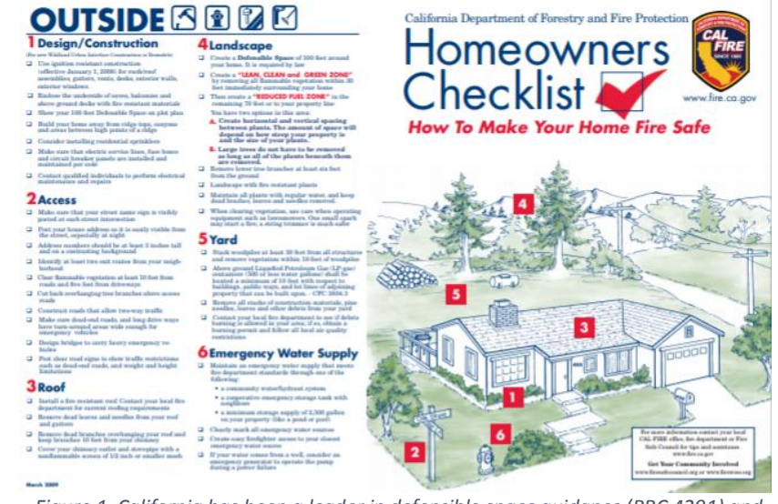
Figure 1. California has been a leader in defensible space guidance (PRC 4291) and construction code policy with Chapter 7A, however, given new awareness of the importance of the noncombustible zone, educational materials need consistent messaging. See point 1 where vegetation is allowed immediately around the house.