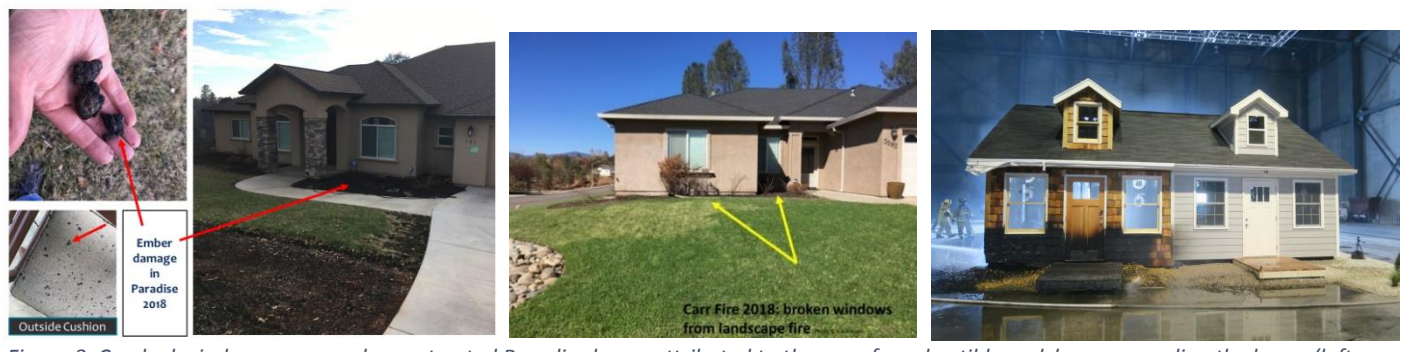
Figure 3. Cracked windows on a newly constructed Paradise home attributed to the use of combustible mulches surrounding the home (left image), cracked windows in Redding attributed to embers igniting combustible mulch and landscape plants (middle image), and new research from IBHS demonstrates the importance of incorporating a noncombustible zone (right image with rock mulch on the right-hand side. See <a href="https://disastersafety.org/wildfire/protect-your-home-from-wildfire/">https://disastersafety.org/wildfire/protect-your-home-from-wildfire/</a> for more details on the research.)