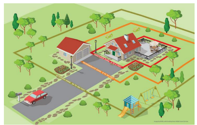
Figure 2. Many organizations in the US and California have already moved to incorporating a noncombustible zone, however, none have as much influence on Californian's behavior as CAL FIRE does.