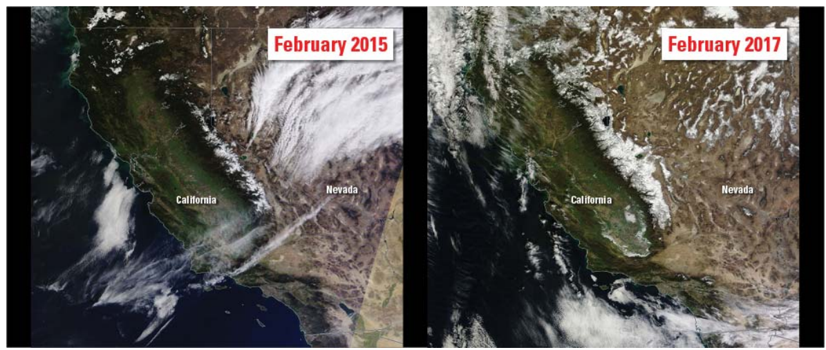
190% of normal in 2017

On April 7, 2017 California State Governor Jerry Brown issued an executive order stating that California was finally out of the drought, except for Fresno, Kings, Tulare, and Tuolumne counties. According to the USGS, the highest snowpack for the year was measured on May 31, 2017 at 190% of normal. Snowpack generally predicts how much water will reach California's streams and reservoirs. Snowpack, through runoff, provides about one-third of the water used by California's cities and farms.