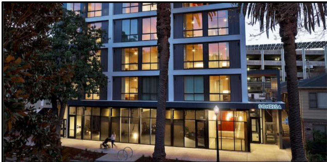
Figure 3. Sonrisa Building

As previously discussed, Sonrisa is the first residential project in Sacramento built with CLT, which was used for horizontal components (i.e., ceilings and floors). The building also features all-electric heating, low volatile organic compound materials, and low water demand landscaping. The Sonrisa project is portrayed below (artist rendering) in Figure 3.