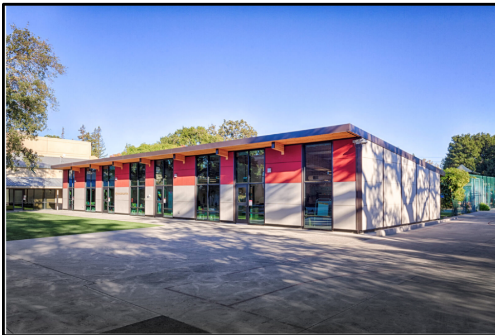
Figure 1. Sacred Heart School, Atherton

San Mateo County completed a 208,000 square foot government office building that is constructed of mass timber, including wood columns, beams, and CLT floor decks. The county claims that it is the first net zero energy design civic building in the U.S. 65 Figure 2 is an artist's rendering of the county's administration building interior.