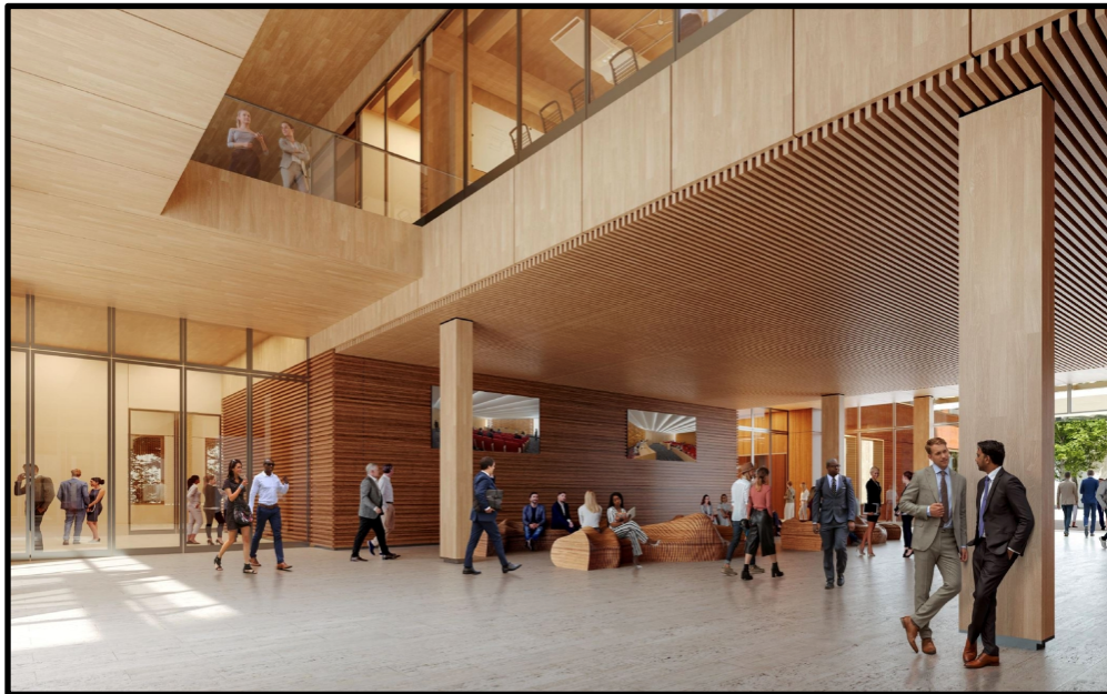
Figure 2. San Mateo County Administration Building

As previously discussed, Sonrisa is the first residential project in Sacramento built with CLT, which was used for horizontal components (i.e., ceilings and floors). The building also features all-electric heating, low volatile organic compound materials, and low water demand landscaping. The Sonrisa project is portrayed below (artist rendering) in Figure 3.