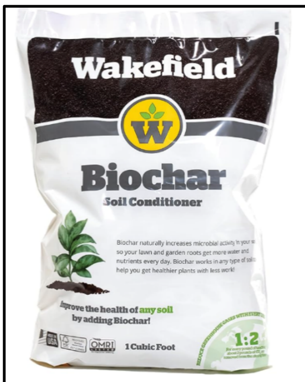
Figure 4. Wakefield Biochar

The Sonoma Biochar Initiative is dedicated to promoting biochar education and its sustainable use throughout California. 71 It is supported by several Resource Conservation Districts, the IBI and U.S. Biochar Initiatives, and other agencies and private companies. The initiative received three grants from CAL FIRE under the Business and Workforce Development program. One will address