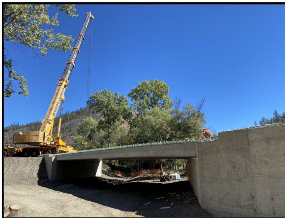
Figure 5. CNC- and Biochar-Infused Concrete Beams

Incorporating CNCs produced by acid hydrolysis into cement has been demonstrated through research studies to increase its hydration and strength. The Moffett Creek bridge replacement in Siskiyou County was done with precast concrete beams using CNCs provided by the U.S. Forest Service, Forest Products Laboratory. 75 The beams were manufactured at the Knife River Prestress plant in Harrisburg, Oregon. The addition of the nanofibers resulted in similar or slightly better concrete properties when compared with conventional concrete. This was the first full-scale demonstration of CNCs as an additive for concrete. The environmental benefits of adding CNCs to cement are associated with reduced embodied carbon in the concrete due to the addition and storage of carbon. Figure 5 shows the beams being installed.