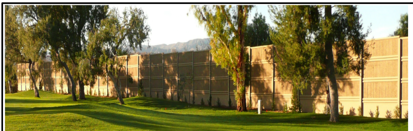
Figure 6. Wood Wool Cement Sound Wall

Troy currently obtains its wood wool cement panels from manufacturing facilities in Latvia and Sweden. It has had several projects in California. These include construction of shooting ranges for local police and sheriff's departments, including the Los Angeles Police Department, a sound wall installation at the Valencia Golf Course bordering Interstate 5 in Santa Clarita (pictured in Figure 6), and recording studios in Los Angeles. The company founder, Bill Bergiadis, holds the patent for the highest rated sound attenuation product in the world. 78 In addition to other projects in the greater U.S. for private companies, Troy has built projects for the U.S. Navy and U.S. Army on military bases in Japan, Hawaii, and elsewhere.