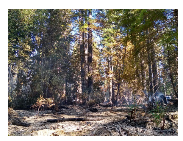
Figure 4: Parlin 17 Prescribed Burn 10/17 - 10/19/2022 within the Parlin 17 THP. Post-fire effects included mosaic burn patterns and consumption of 1 and 10-hour fuels while more charring of 100 and 1000-hour fuels.