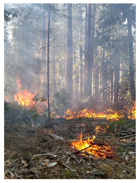
Figure 3: Parlin 17 Prescribed Burn 10/19/2022 within the Parlin 17 THP. Fire moving through about two years post-harvest.

The feasibility of prescribed burning happening within the timeframe of the grant on JDSF is pretty high. JDSF has conducted two prescribed burns (Figures 2, 3 and 4) on the Forest in the last two years, one of which was a fall burn (October 17-28<sup>st</sup>, 2022). This proposed project would be conducted in the fall for the following reasons: 1. fires traditionally burned in the fall, 2. conditions are usually drier which could result in increased fire behavior – this leads to a better representation of burn affects to compare to a model that is not well suited for redwood/Douglas-fir