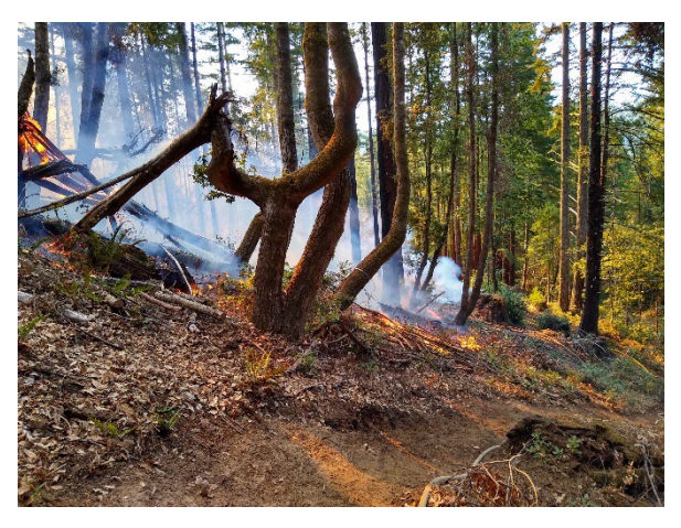
Figure 2: Parlin 17 Prescribed Burn 10/19/2022 within the Parlin 17 THP. Fire backing down slope to the control line.

Since fire is a natural part of the California ecosystem and these rules are not ensuring no fire will be present after treatment, it is assumed that fire will eventually occur. One of the metrics to determine effectiveness of the rules will