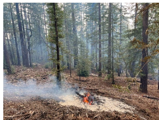
Figure 2: Longridge Pile Burning.