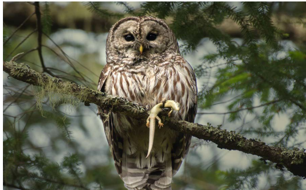
Figure 1: A barred owl with a northern alligator lizard.