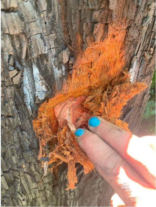
SVR Redwood Study Tree – Cambium check