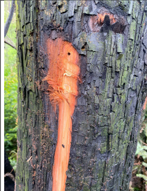
SPR Redwood Study Tree – Cambium check with insect bore holes