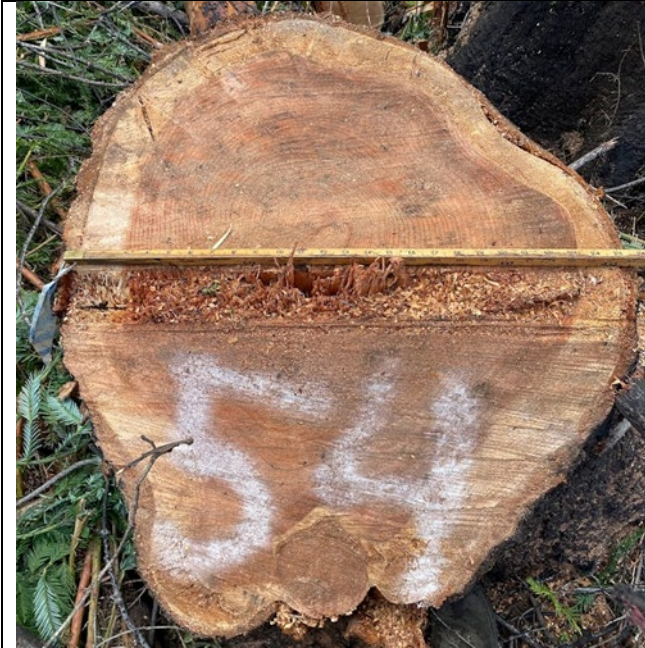
SPR Redwood Study Tree