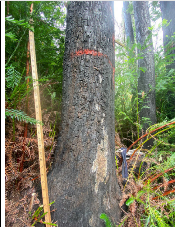
SPR Redwood Study Tree with Wet Rot fruiting bodies ( Coniophora puteana )