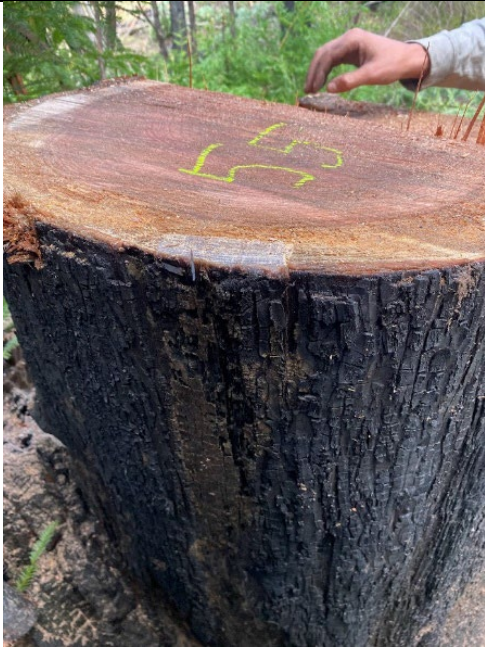
SPR Redwood Study Tree