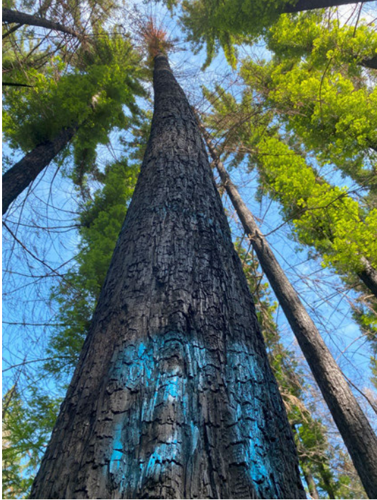
SVR Redwood Study Tree