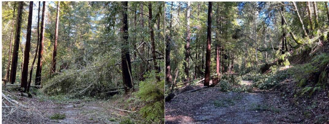
Some of the damage from snow on roads and forest areas.