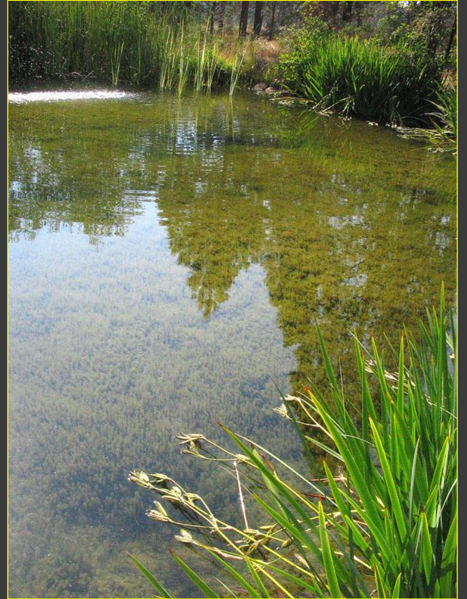
Dense mat of Hydrilla verticillate , an "A" rated weed