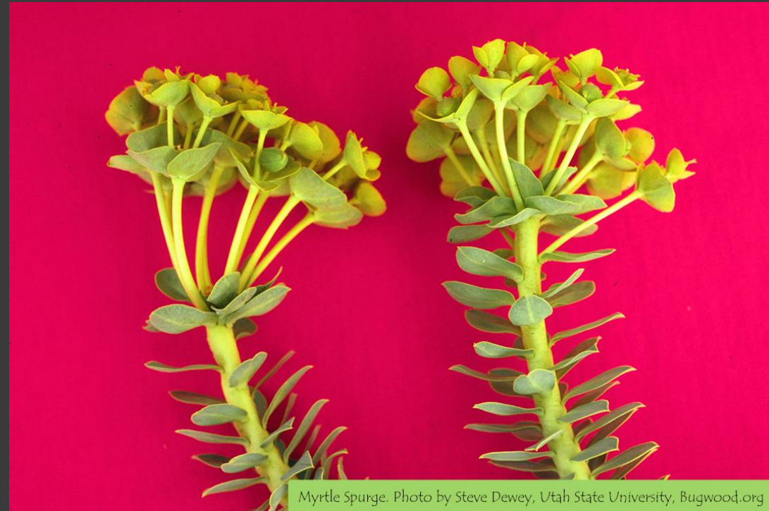
Myrtle Spurge, an “A” rated pest