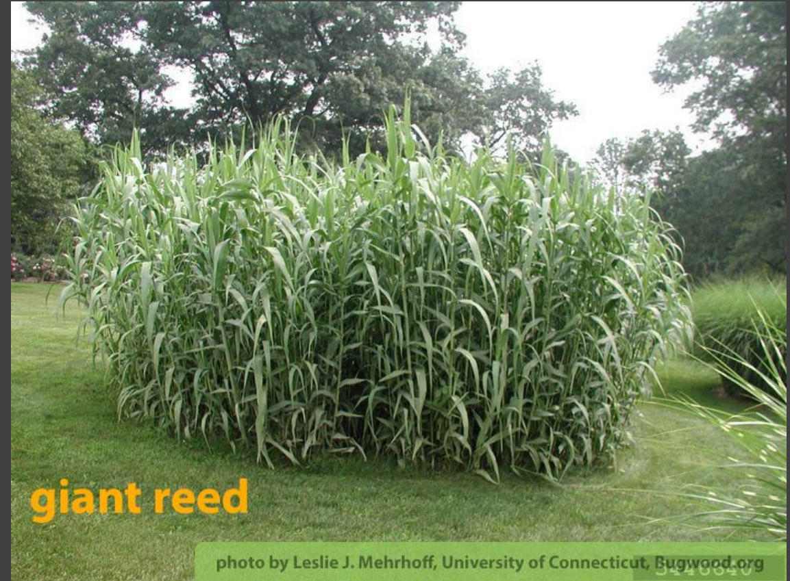
Arundo donax , Giant reed, a “B” rated pest