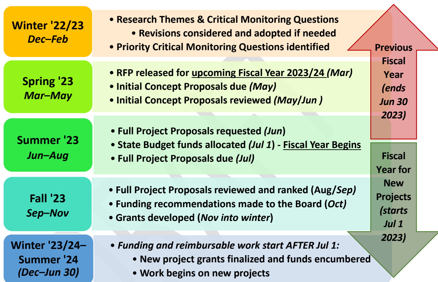
Figure 1. EMC Project Submission and Grant Processing Timeline – Example of Funding Cycle for Fiscal Year 2023/24. Key: RFP = Request for Proposals.

38 EMC projects are solicited through an annual Request for Proposals (RFP) which is released following the 39 start of the new FY (see Figure 1 ; also see the most recent RFP, EMC 2024c ). The RFP, ranking, and selection 40 process are detailed in the EMC's Strategic Plan ( EMC 2022 ).