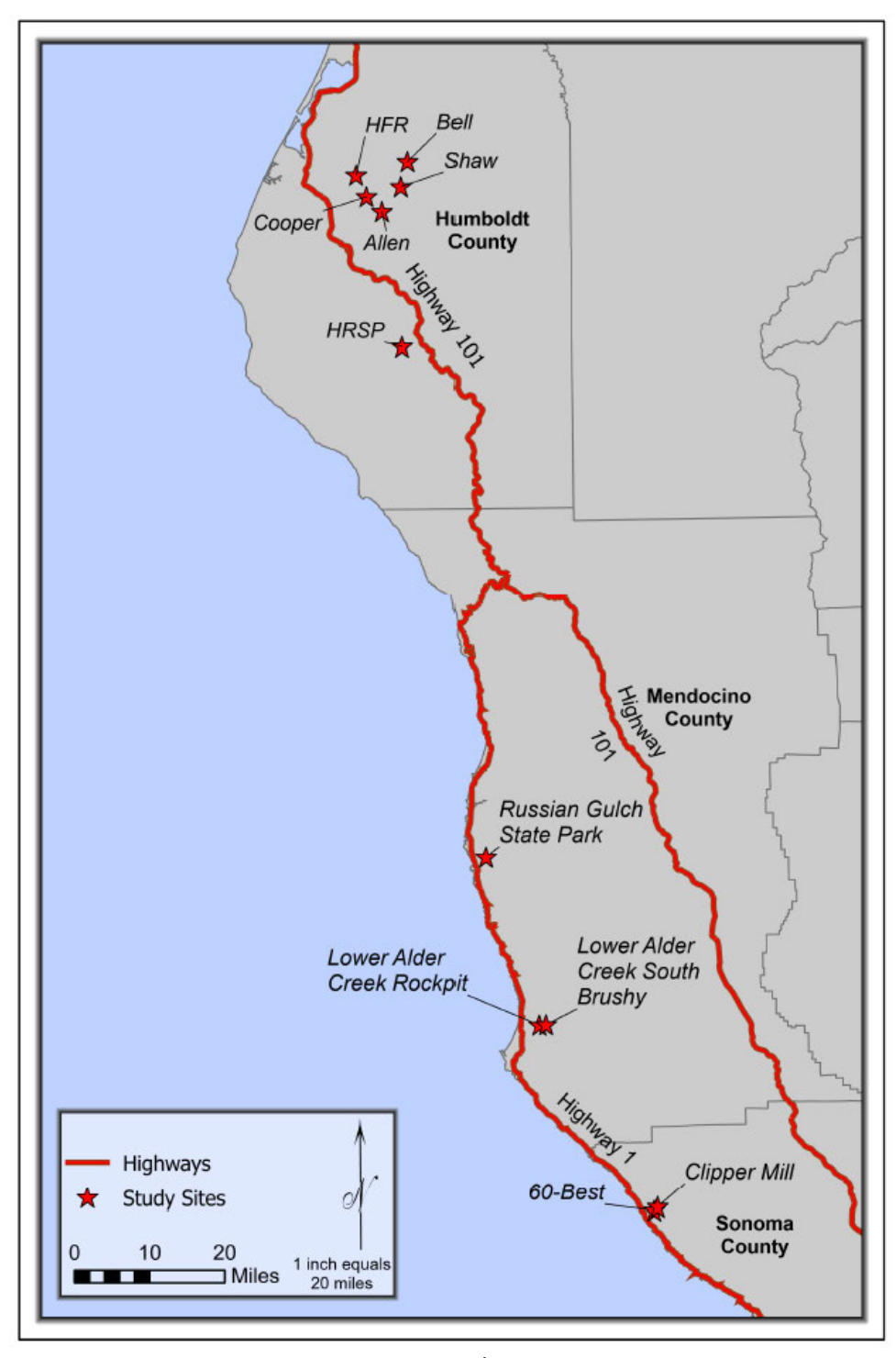
Figure 1. MAMU Study Site Locations