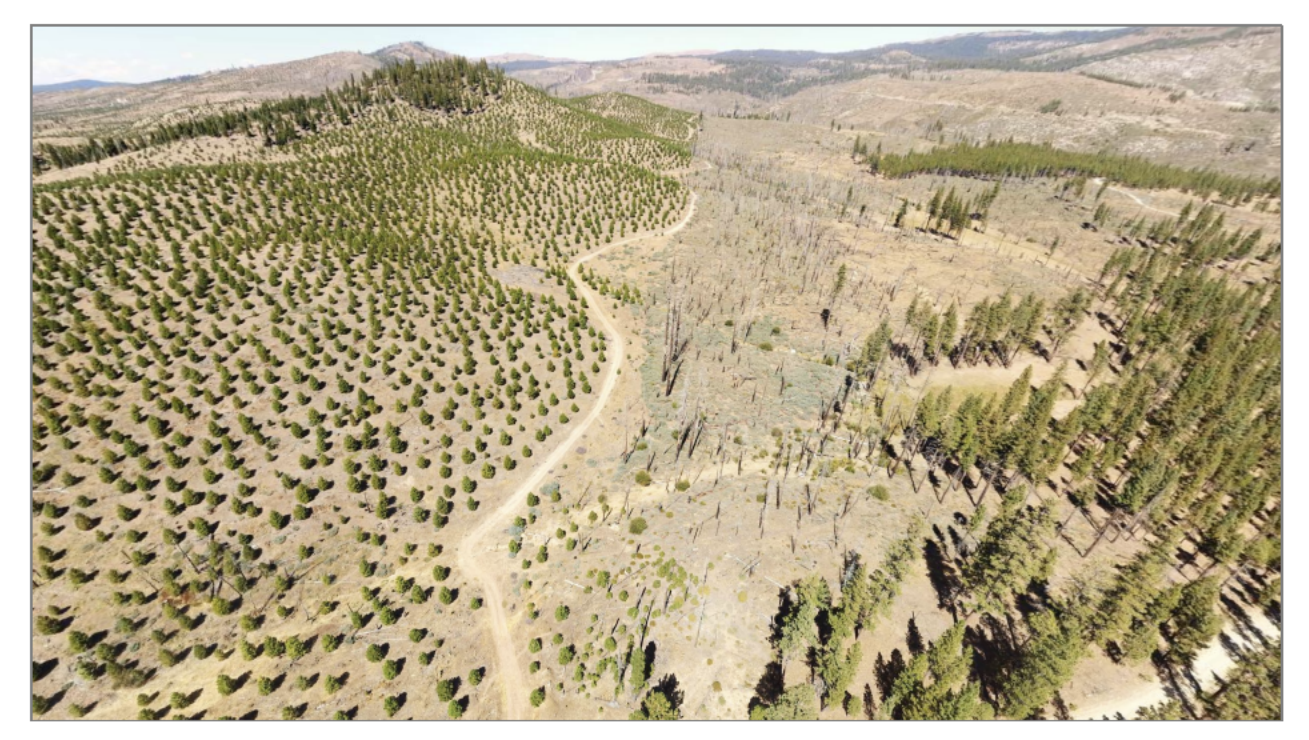
Figure 5 - USFS (right) private land (left) boundary. The change from forest to shrub can be detected by the existing Post Wildfire Vegetation Monitoring System.

Step 5-Plumas County Field Case Study of Stream Condition: Within the Dixie and Moonlight Fires, 3 perennial and 3 ephemeral streams will be selected for detailed field study examining current condition of riparian areas in burned areas along private and public land boundaries. Within these case studies, percent cover of vegetation, current reforestation, and evidence of erosion will be documented (Figure 6). In addition, case study sites will be flown using a UAV to generate current condition high resolution imagery for use in the assessment to validate cover estimates. SIG has used UAVs in this area on past projects to map vegetation at high resolutionan example of imagery collected is available here (UAV Image Data Example <u>https://gsal.siggis.com/portal/apps/webappviewer/index.html?id=7cddcb5ee30d4c3e86f1463156eec8dc</u>)