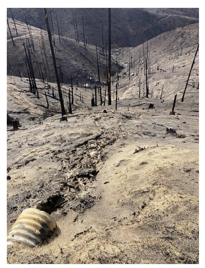
Figure 6 - East Branch of Lights Creek within the footprint of the 2021 Dixie Fire. This area also burned in the 2007 Moonlight Fire.

Step 6-Report: Data and spatial information will be summarized into report form with online maps. All geospatial data will be provided electronically in ESRI compatible format.